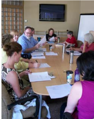
Library subject specialists meet to work on the Materials Budget Reduction Project. More on p. 4.